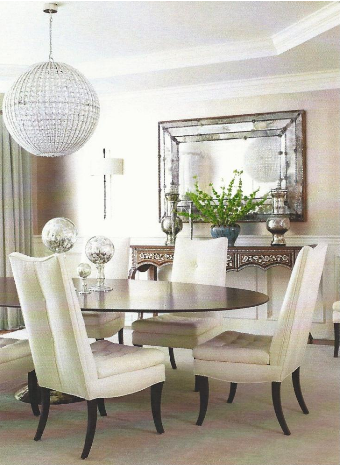
LEFT Platinum-leaf wallpaper above white wainscot in the dining room provides a quiet sheen behind a Venetian mirror. Mother-of-pearl inlaid console by Lynne Scalo Design.