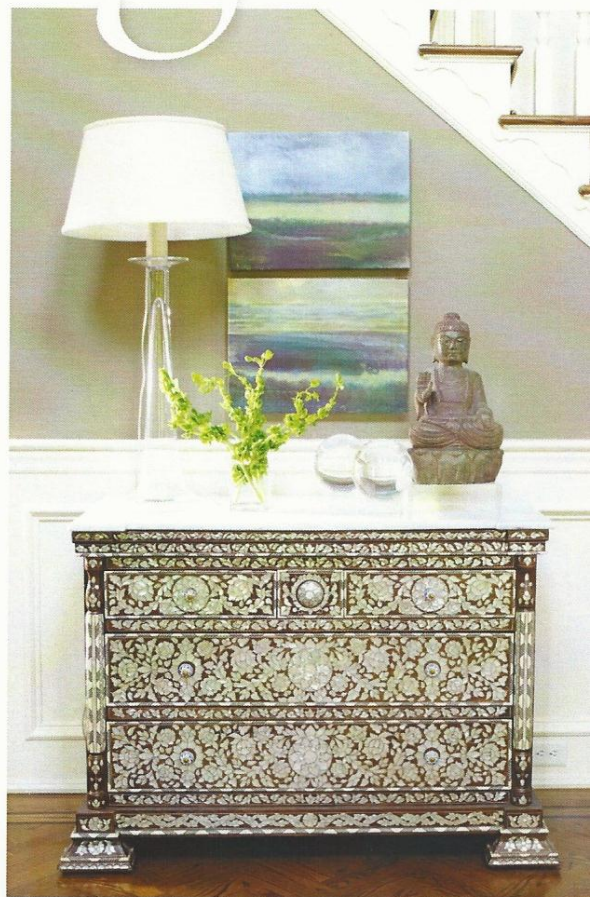
ABOVE A mother-of-pearl jewel by Lynne Scalo Design sparkles in a hallway. Painting is done in peacock blues, golds and greens.