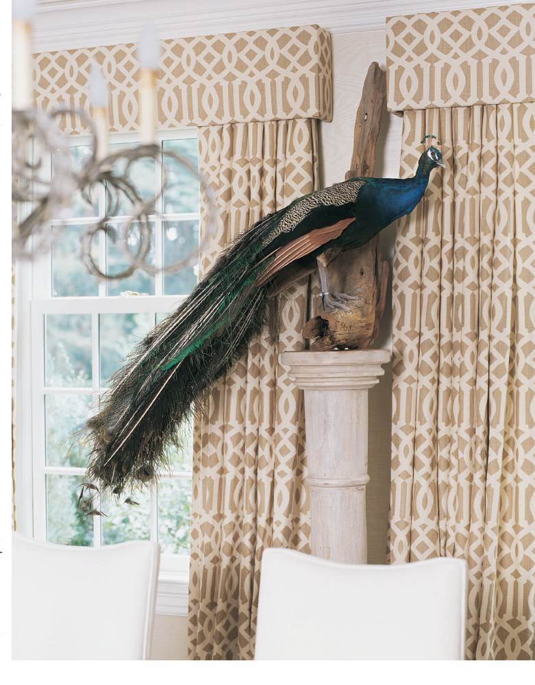
LEFT: In the master suite, a custom-made hand-loomed wool rug with a shell design is positioned underneath a bed that Lynne designed. Mahogany nightstands flank the bed. ABOVE: The most unique feature of the dining room is shown here. A peacock Lynne found on one of her trips adds a touch of whimsy and further cements the nature theme throughout the house. Perched on a vintage limestone pedestal, the peacock's brilliant colors reflect the light to add brightness and interest.

Outside the dining room directly across from the entrance on the opposite wall is a stunning chestnut and white painted curved staircase. To take full advantage of the architectural interest the staircase provides, Lynne had five hand painted English serpentine silver-leaf works of descending size created to complement the curve of the walls. The prints are topped by a strategically positioned skylight that adds brightness to the area and a 1920s Chinese chandelier.